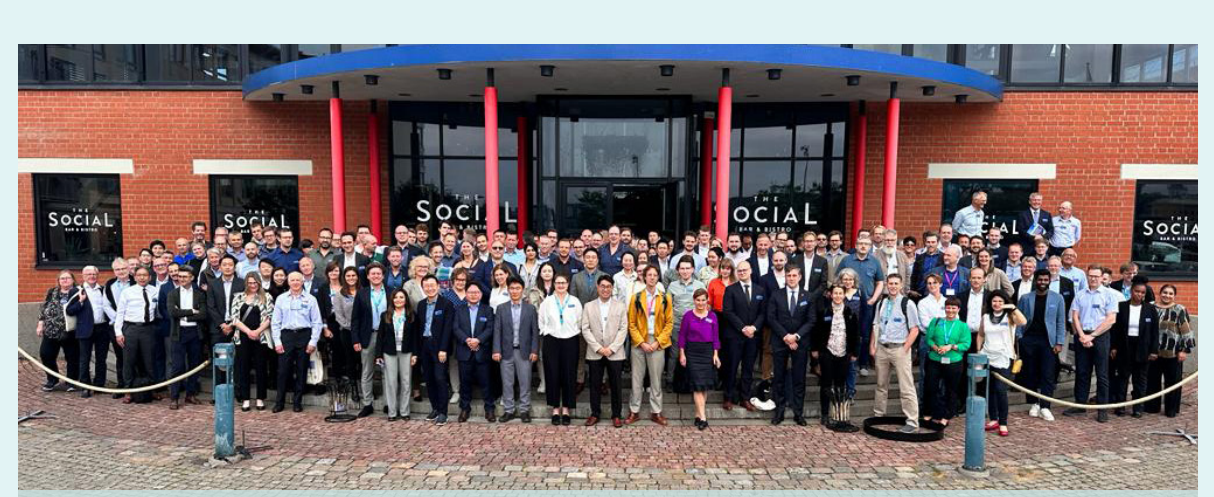
Image: I-Tech and RISE (Research Institutes of Sweden) brought the marine antifouling community together to address future biofouling prevention.

Since the listing on Nasdaq First North Growth in 2018, the company has grown both customerwise and financially. The market is dominated by nine major paint companies where nearly all work actively with the company's technology. Six of them are commercially active and the others are in the development stage. Thanks to a continued stable financial position, clear investments have been made in the core business. Within the regulatory area, the geographical coverage is increased step by step at the same time as upgrades and renewals of existing approvals are required at regular intervals. The company also invests in research and development in line with the strategy of offering a higher level of knowledge about Selektope's formulation properties in antifouling coatings. The continuous improvement work has also led to an increased delivery capacity and efficiency in the production chain.