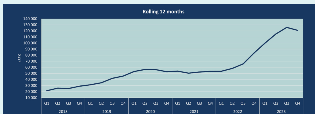
Image: The graph shows the company's 12-month turnover starting in the first quarter of 2018.

After a long period of strong sales growth, the last quarter shows a decrease due to temporary headwinds in sales.