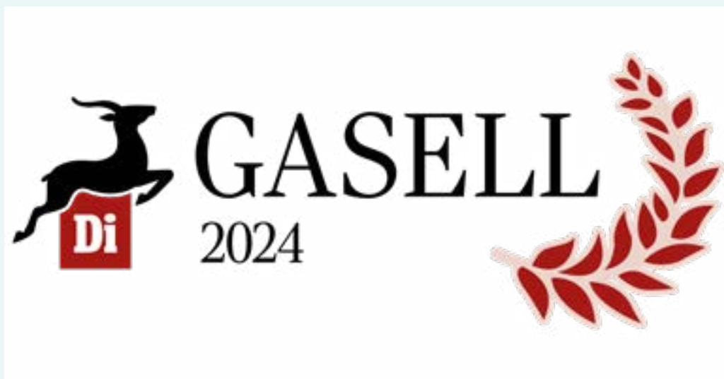
Images: I-Tech received the DI Gazelle award

Since the listing on Nasdaq First North Growth in 2018, the company has grown both customer-wise and financially. The market is dominated by nine major paint companies where nearly all work actively with the company's technology. Six of them are commercially active and the others are in the development stage. Thanks to a continued stable financial position, clear investments have been made in the core business. Within the regulatory area, the geographical coverage is increased step by step at the same time as upgrades and renewals of existing approvals are required at regular intervals. The company also invests in research and development in line with the strategy of offering a higher level of knowledge about Selektope's formulation properties in antifouling coatings. The continuous improvement work has also led to an increased delivery capacity and efficiency in the production chain.